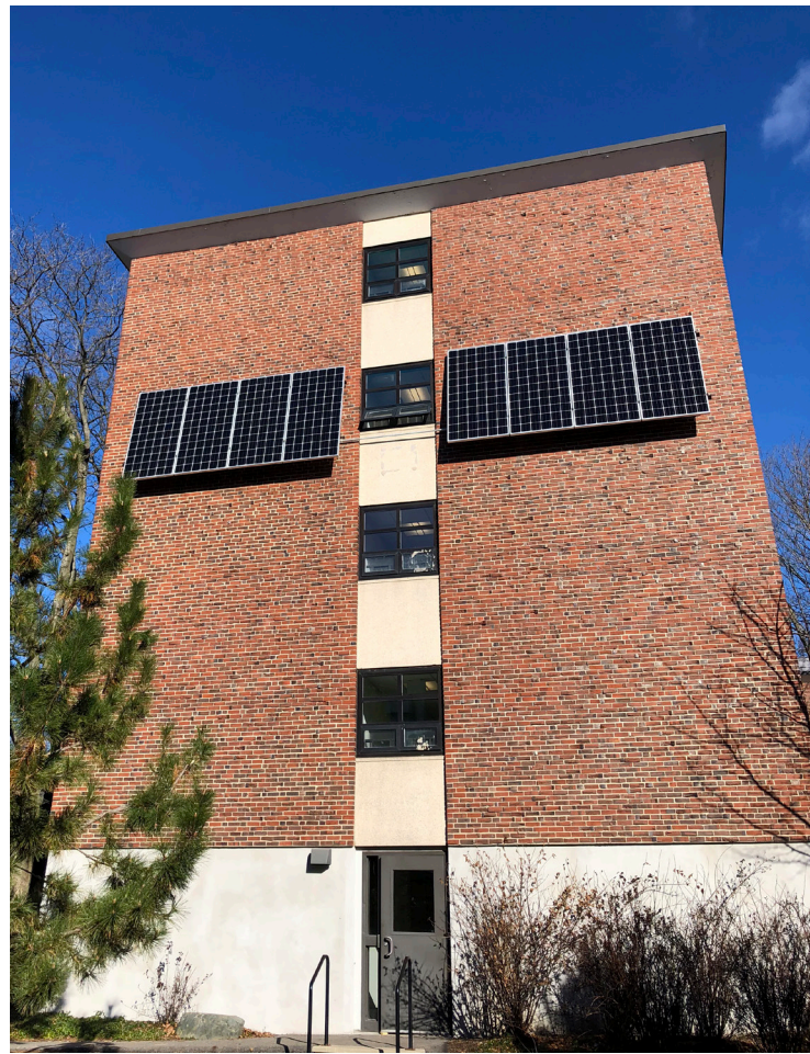
Solar panels newly installed on Hodgdon Hall