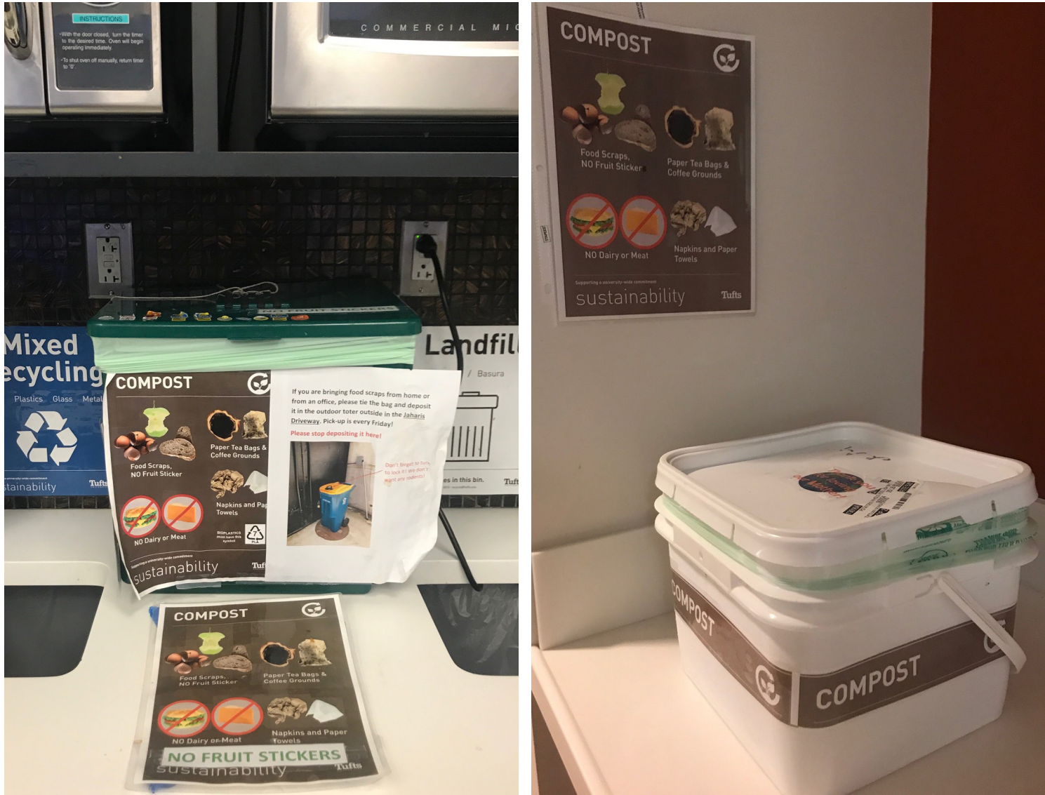
Compost bins installed throughout Jaharis