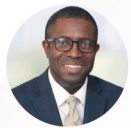
FREDERICK MORRIS KPMG LLP

Overview of the funding available to colleges and universities to meet your decarbonization goals under the IRA, including the new direct pay provision for non-taxable entities along with prevailing wage/apprenticeship and domestic content requirements.