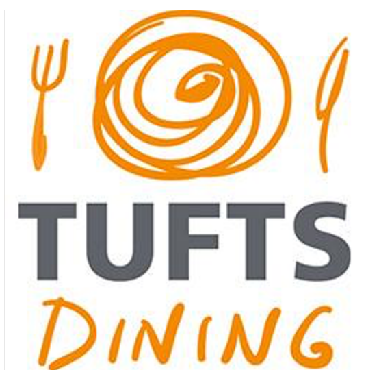
Some of many TFSA Collaborators