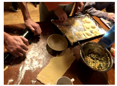
Tufts students making ravioli at the Loj.

• Divert estimated 660 gallons organic material per year from waste stream