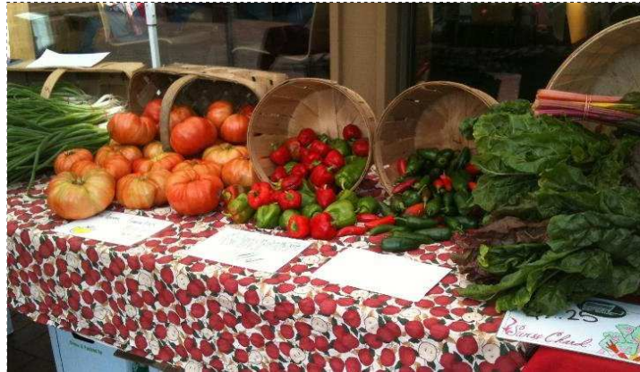
How about some lovely fresh vegetables? The Tufts Farmers' Market is back at the Mayer Campus Center Patio every Wednesday from now until October.

"The new Presidential council on sustainability will assess strategic directions to ensure that our campus operations reflect the commitment to the environment that informs our extraordinary academic work in this arena," he wrote. "While taking a broad view, the council will look particularly closely at carbon management, waste and water."