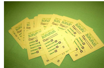
Diners collected punches as they visited booths about "The Story of Bananas" last week.

Diners who heard the full Story from Cultivation to Disposal were entered into a raffle to win the grand prize - a pizza and cupcake party from Tufts Dining - while several people brought home one of the inflatable bananas along with a new store