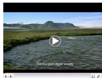
Dreamland trailer with subtitles

What does sustainability look like in a country with abundant renewable energy? Environmentalists and industrialists alike are trying to save Iceland. This Nordic country has substantially more renewable energy than its citizens consume and, as its economy evolves, the emerging choices about energy projects and wilderness may diverge around different futures. Join Andri Snær Magnason, who changed the Icelandic national discourse with his book and film Dreamland . The New York Times calls Dreamland "a devastating polemic that puts Iceland's environmental issues into a global perspective". Event details on MIT DUSP's website .