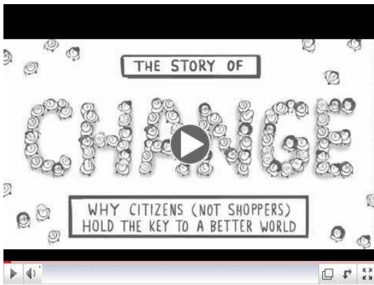
The Story of Change (2012)