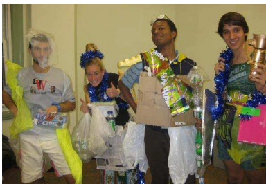
Metcalf RAs dressed in "trashion."

The Daily has been particularly interested in the goings on in our office this week. Following the write up about the Environmental Action class on the front page of Thursday's paper, today's paper highlighted the new (well... returning) Eco-Reps program. Read about it here .