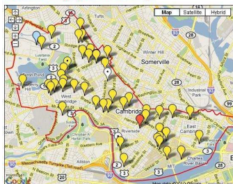
Renewable Energy Systems In Cambridge

The Cambridge Community Development Department has updated maps showing the locations of renewable energy systems and green building projects in Cambridge.