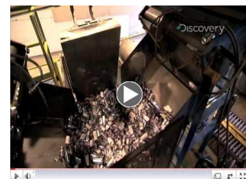
HowStuffWorks - Recycling Aluminum

In the spirit of RecycleMania, watch this interesting video clip detailing the aluminum can recycling process and how it is helping to save the planet!