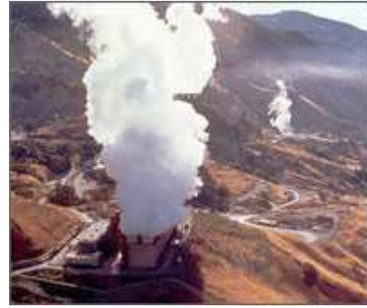
Geothermal power plants at The Geysers

The department hopes to use the money to reduce the upfront cost of geothermal energy systems, expand their use, and enable the United States to tap the huge potential of this clean and renewable energy resource. This is another step towards reaching the Obama administration's goal of 80% clean electricity by 2035.