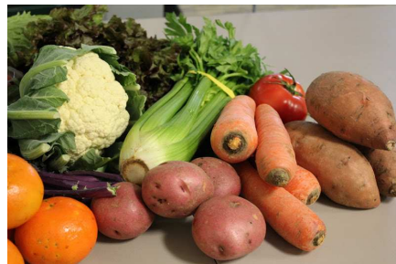
CSAs deliver fresh vegetables weekly to Medford (Miller Hall) and Boston (Jaharis Building)

We are pleased to announce that World PEAS Community Supported Agriculture (CSA) is offering a limited quantity (up to 20) of Fall Season Academic Farm Shares that would run for six (6) weeks from September 5 to October 10. The shares will be delivered weekly on Wednesdays to Medford and Boston and cost $168. Sign up at the World PEAS website or call 978-654-6745 (x5733) or email worldpeas@comteam.org .