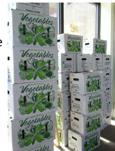
Farm shares are delivered to Tufts' Medford and Boston campus every week

I look at the boxes of farm share vegetables stacked in our office entryway and feel optimistic that Tufts is going in the right direction by buying local and supporting our local farmers. Personally, I like knowing where my food came from and I especially value being able to walk up to the farmer and ask what went into my fruits and vegetables. If you want to sign up for farm shares this fall or check out the farmers markets nearby, look for details and a market schedule below. You can download the PDF or learn more about Community Supported Agriculture (CSAs) on our website .