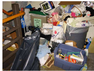
Can you spot the recyclables?

Student move-out generates (literally!) tons of trash every year. This past spring - for the second year in a row - the Tufts Facilities Department halted trash collection during move-out and hired a recycling company instead. Custodians were given permission to dispose of bags of trash and bags of recycling in the same dumpster, then the dumpsters went to EL Harvey and Sons where recyclables and trash were manually separated. Fifty-two (52) tons of recycled material was separated from the initial 77 tons collected, resulting in a 67% recycling rate!