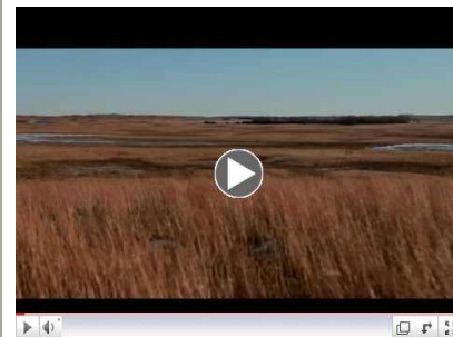
Guarding the Ogallala

Oil and water do not mix. This video tells the story of the Ogallala Aquifer -