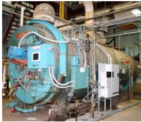
One of two updated boilers at the Central Heating Plant

Unbeknownst to most people who live and work on the Tufts Medford campus, the Central Heating Plant was forced to switch fuels in the middle of last winter. Shortly afterwards, a routine inspection led to the discovery of issues with two of the fuel tanks outside the Central Heating Plant and prompted the university to move up scheduled upgrades for two boilers that were installed in the 80s. The upgraded boilers are not only more efficient, but they have the ability to burn both natural gas and No. 2 fuel oil. Read more...»