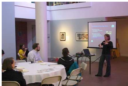
Green Restaurant Association presentation