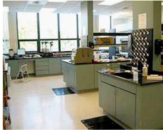
The labs at 200 Boston Ave

This is a fantastic list of accomplishments, and we have been told there are even more good changes coming this year.