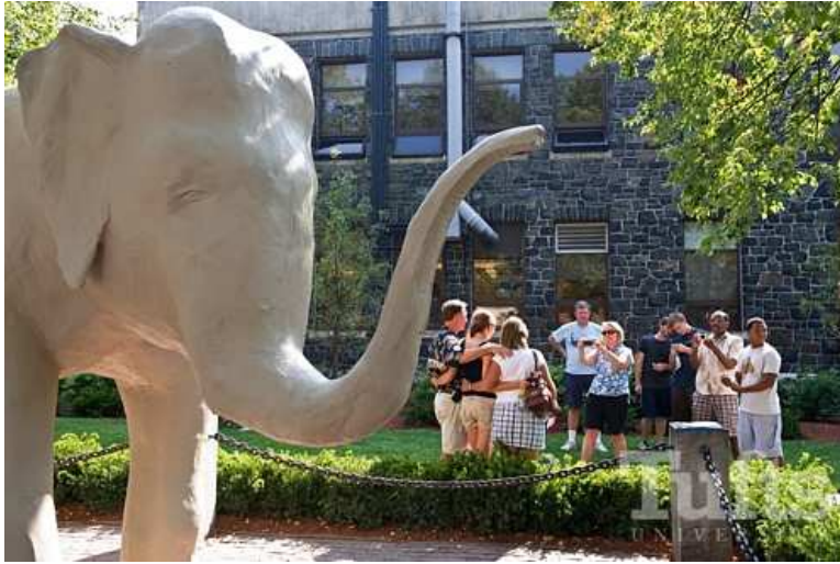
Matriculation Day is happening on Aug 31! Does Jumbo need his hair and makeup done?

The Office of Sustainability is back in Miller Hall and our newsletter has come back from its hiatus as well! With a new look and original content, the newsletter will now be delivered to your inboxes once a month, with a separate "Events and Jobs" update sent out on a weekly basis.