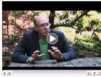
Vanishing Of The Bees - Official Trailer

Honeybees have been mysteriously disappearing across the planet, literally vanishing from their hives. Known as Colony Collapse Disorder, this phenomenon has brought beekeepers to crisis in an industry responsible for producing apples, broccoli, watermelon, onions, cherries and a hundred other fruits and vegetables. Conflicting options abound and after years of research, a definitive answer has not been found to this harrowing mystery.