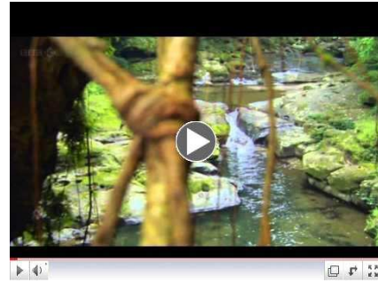
Meghalaya's Living Bridges