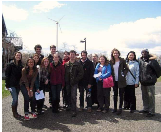
Tufts students and staff members visit Medford wind turbine site at McGlynn Middle School

Last Monday, the Tufts Eco-Reps (along with a few Eco-Ambassadors and staff members who graciously offered to give us a ride) took a field trip to the wind turbine site at McGlynn Middle School in Medford... a mere three miles from the Tufts campus! If you've ever driven down I-93 or the Mystic Valley Parkway, it's hard to miss the towering 150-foot-high structure next to the Mystic River. The renewable energy icon was officially unveiled back in January 2009 but has already generated upwards of 250,000 kWh of energy since it became operational 3 years ago.