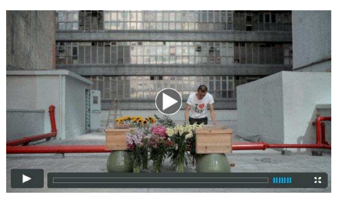
Nokia - HK Honey