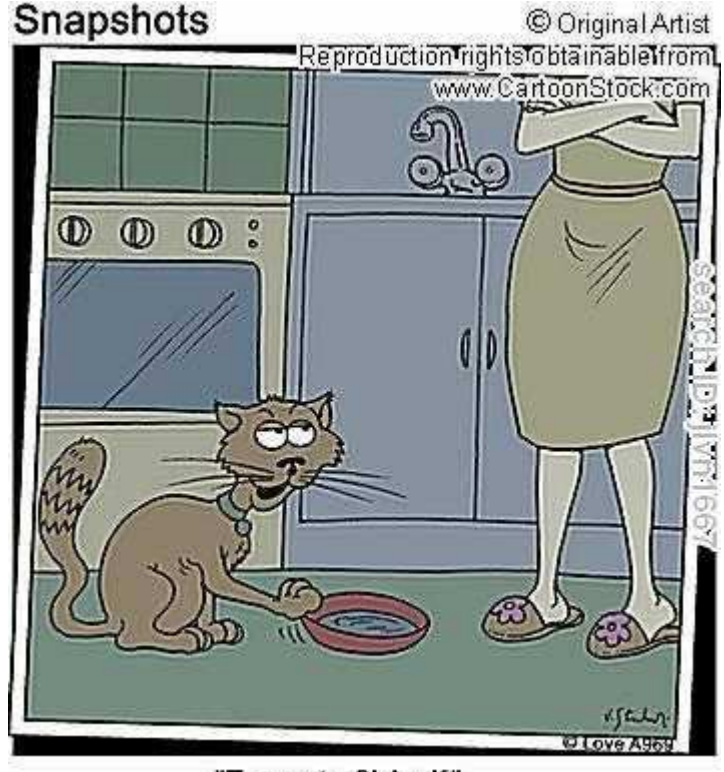
"Tap water?! As if."