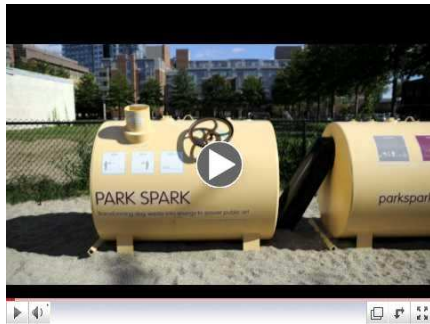
The Park Spark Project

Check out this quick video, which gives a great overview of the project: