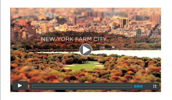
New York Farm City